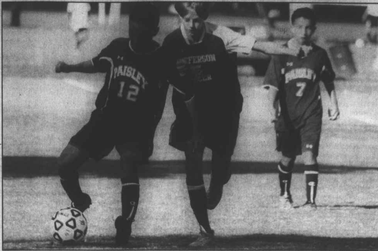
The Paisley defender attempts to keep the Jefferson striker away from the ball.