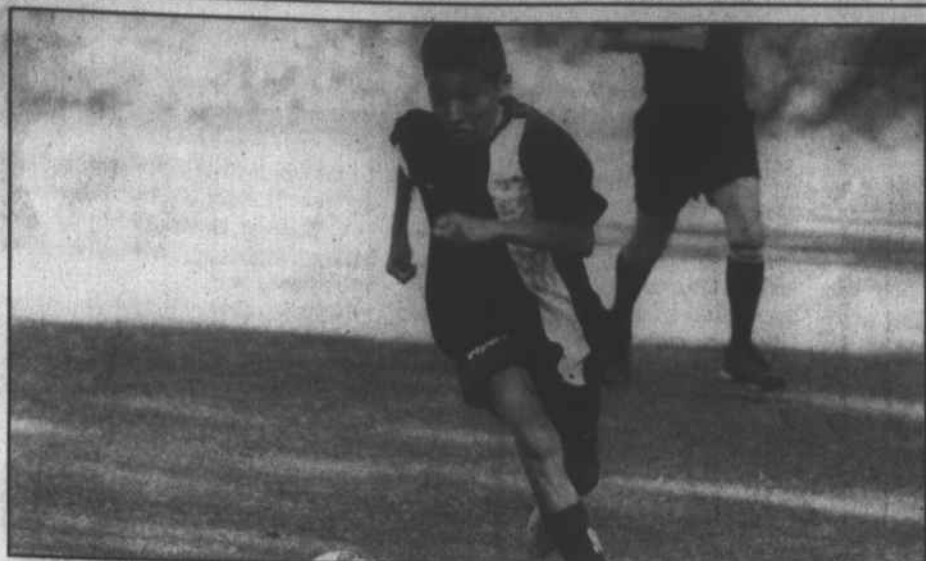
The Flat Rock player chases the ball before it goes out of bounds during their game against the Wiley Wolverines.