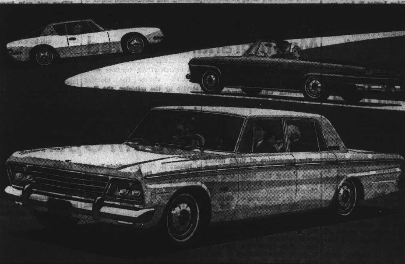
Top, the challenging Avanti. Right, the breezy Daytona convertible. Center, the big luxury family Cruiser.