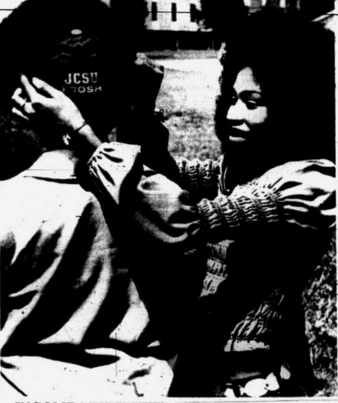
INCOMPATIBILITY? Nay, Not So! These two enterprising Freshmen from Johnson C. Smith University blend the old tradition of Frosh Cap wearing with the new, fad style, of the Afro Hair-do by the ingenious application of four bobby pins and an adept half-fold of the blue and gold frosh cap and cause the twain to meet.