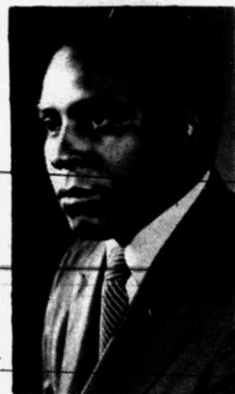
VERNON E. JORDAN, JR.

It has resulted not only in their disenfranchisement, but also in broken promises and inequities. Back in 1874, Congress promised to pay half