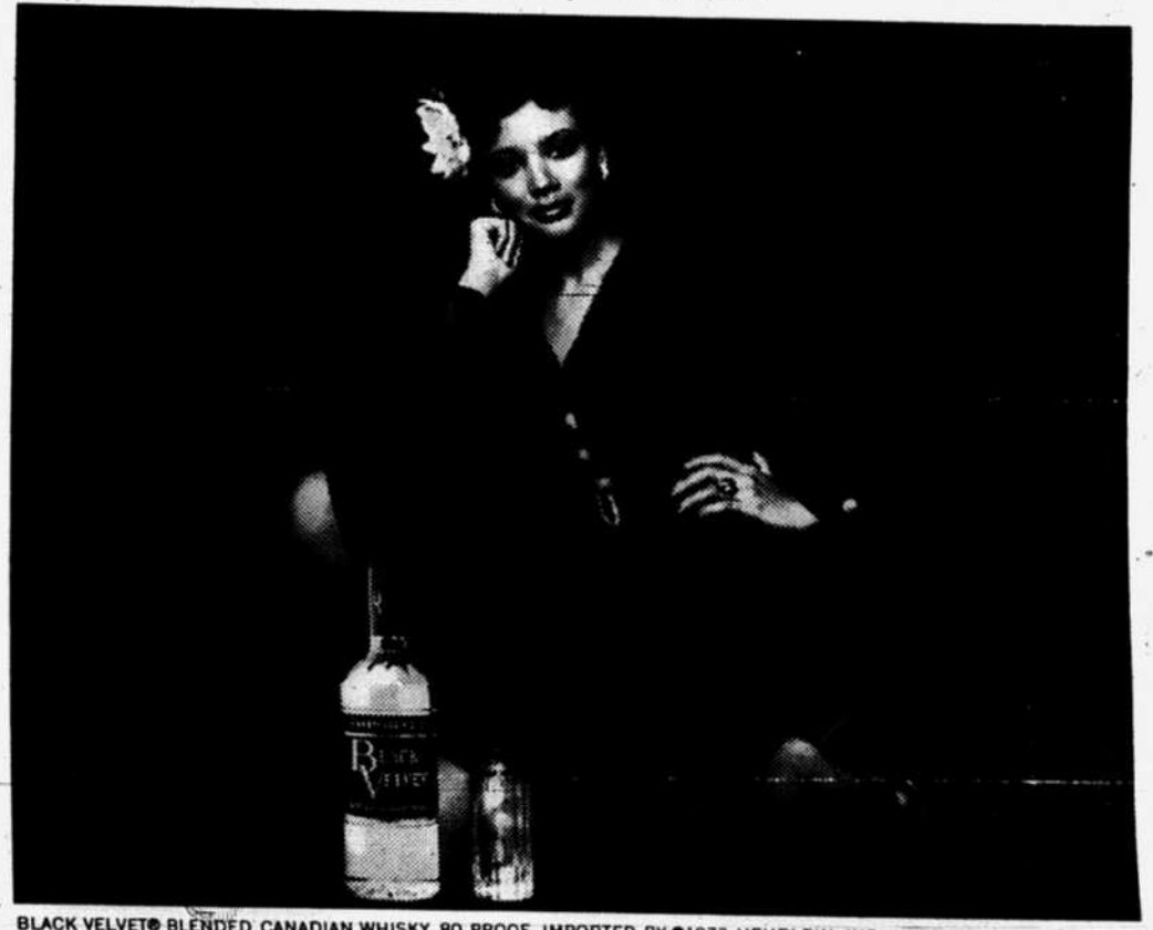
BLACK VELVET® BLENDED CANADIAN WHISKY, 80 PROOF, IMPORTED BY ©1973 HEUBLEIN, INC., HARTFORD, CONN.

Every man wants to feel the smooth, imported whisky from Canada. And every woman, too.