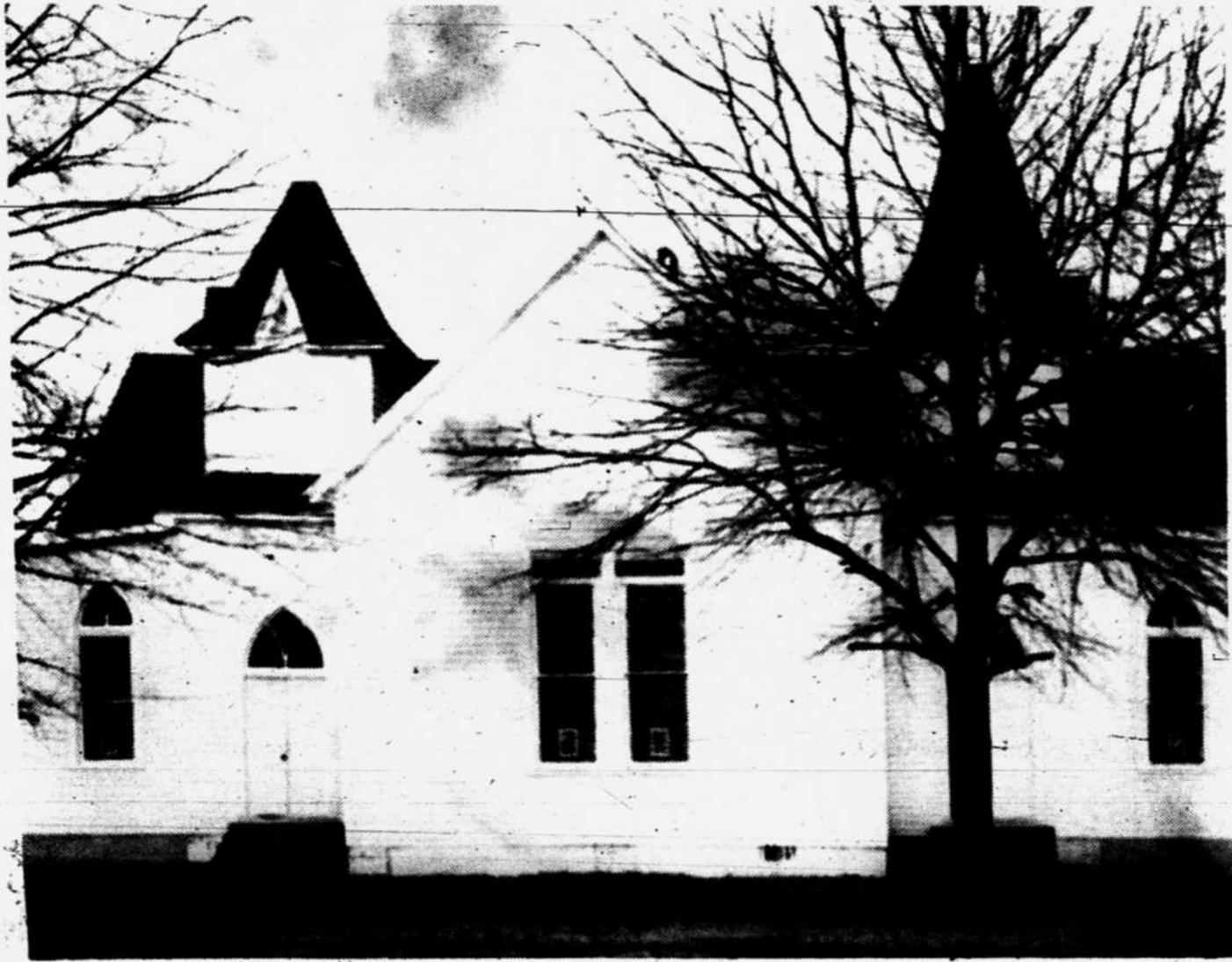
Site of the present Matthew - Murkland Church