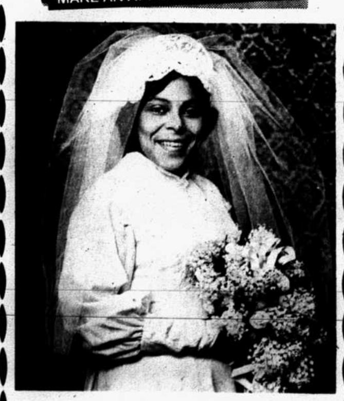
First ....For Fine Photography