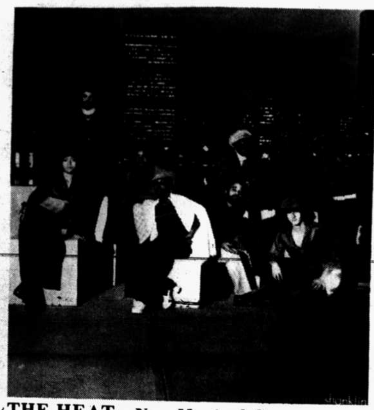
THE HEAT ... New Musical Group