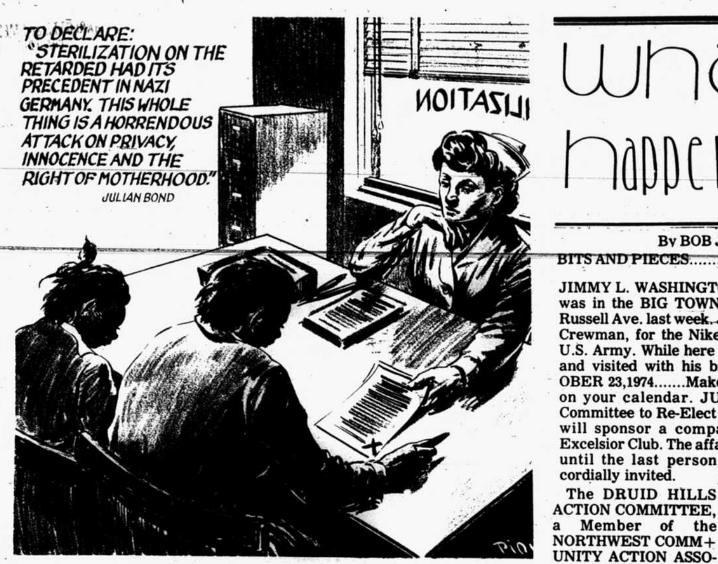
ONE WAY TO REDUCE THE "BLACK PRESENCE