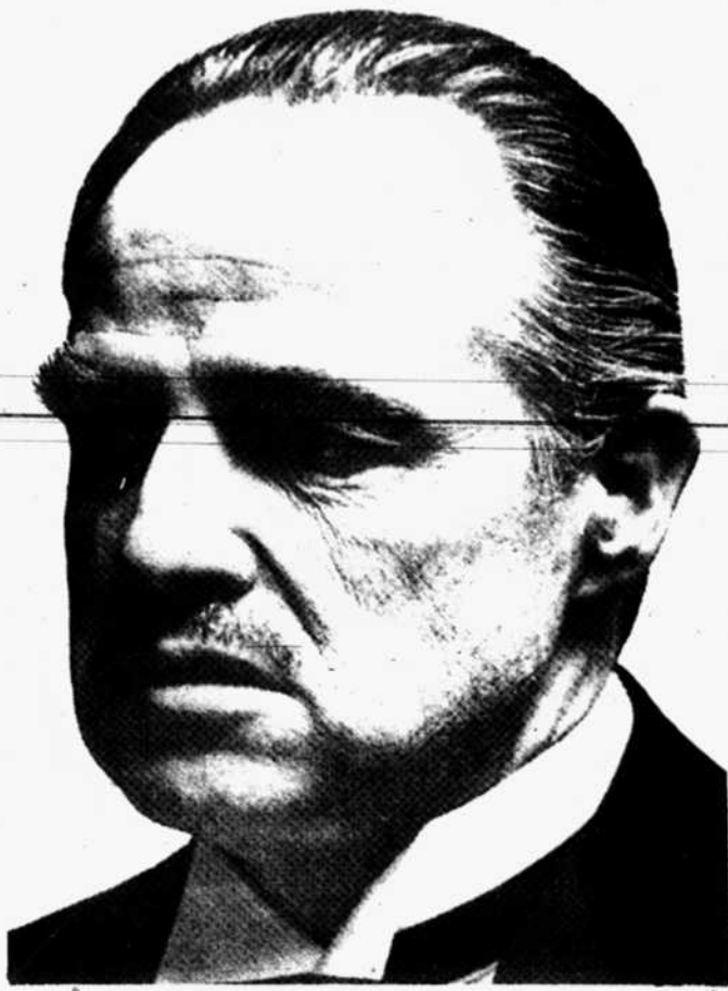
MARLON BRANDO ..Stars In NBC Movie

That $20,000 sable Diana Ross shrugs herself into these nights shows distinctly that the lady doesn't have to sing the blues anymore. She was in New York recently to pick up a 12-fur wardrobe at Maximilian's for her new film, "Mahogany" which will shoot on location in Rome and Chicago.