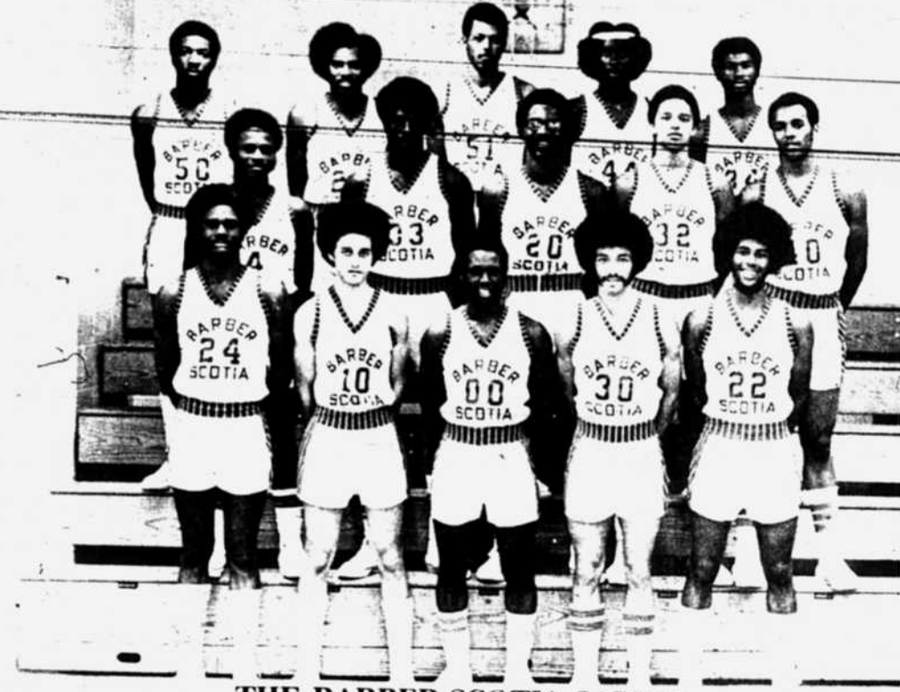
THE BARBER-SCOTIA SABRES