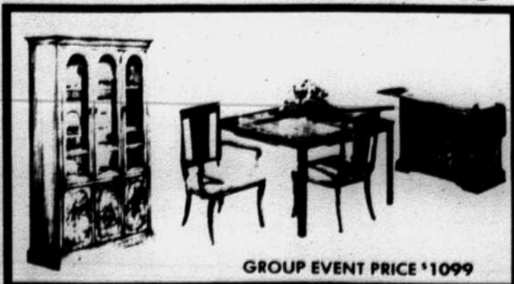
GROUP EVENT PRICE $1099