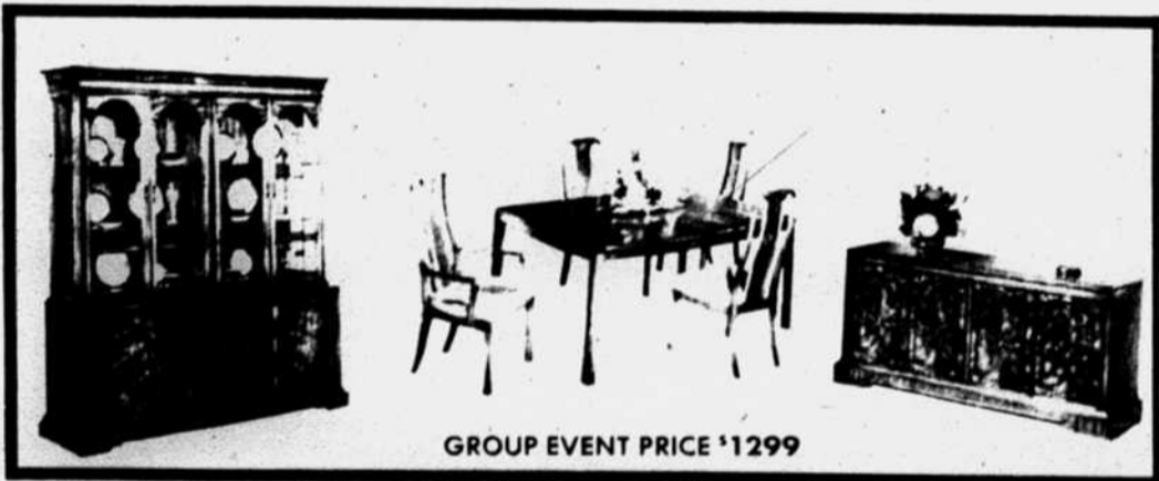
GROUP EVENT PRICE $1299