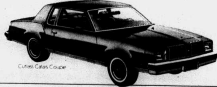
Cutlass Calais Coupe