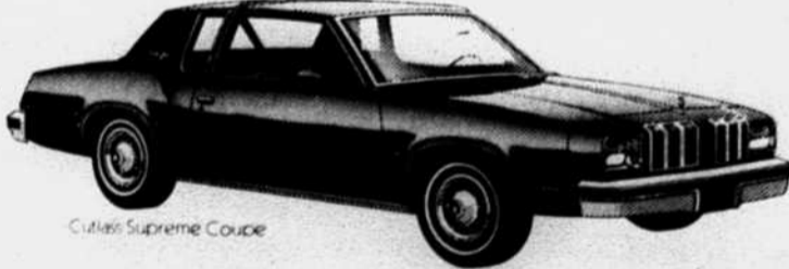
Cutlass Supreme Coupe

expect in an expensive luxury car—now in an agile, practical mid-size car. Make plans to test drive a 1978 Olds Cutlass soon.