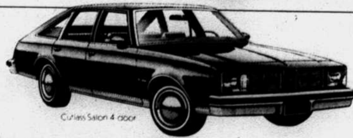
Cutlass Salon 4 door