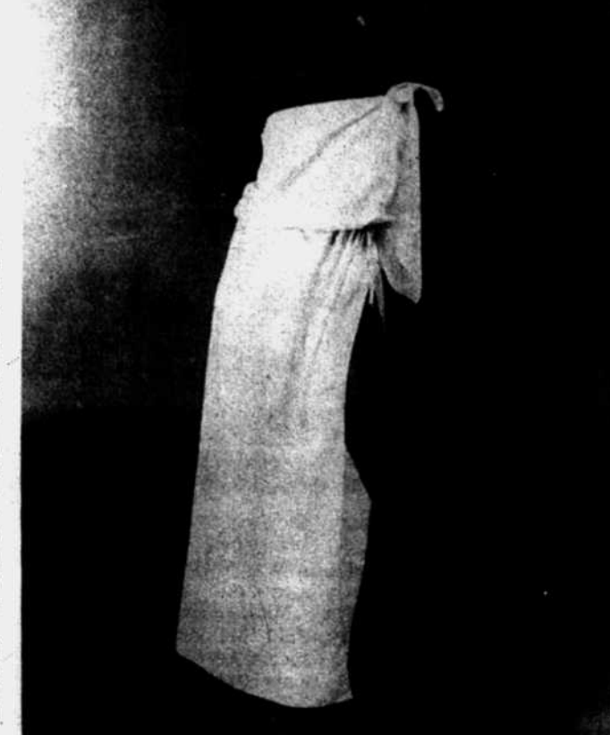
EBONY FASHION FAIR

The committee will make recommendations on revisions the school administration should consider to improve effectiveness of school causes it benefits."