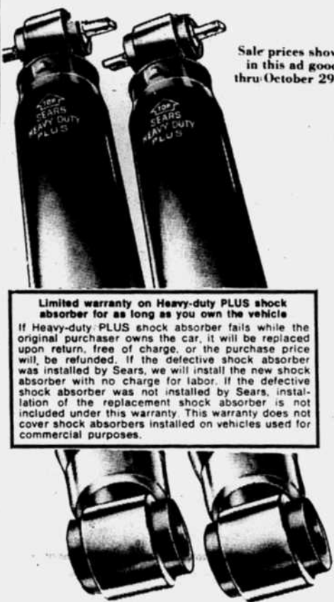
Sale prices shown in this ad good thru October 29th.

Limited warranty on Heavy-duty PLUS shock absorber for as long as you own the vehicle. If Heavy-duty PLUS shock absorber fails while the original purchaser owns the car, it will be replaced upon return, free of charge, or the purchase price will be refunded. If the defective shock absorber was installed by Sears, we will install the new shock absorber with no charge for labor. If the defective shock absorber was not installed by Sears, installation of the replacement shock absorber is not included under this warranty. This warranty does not cover shock absorbers installed on vehicles used for commercial purposes.