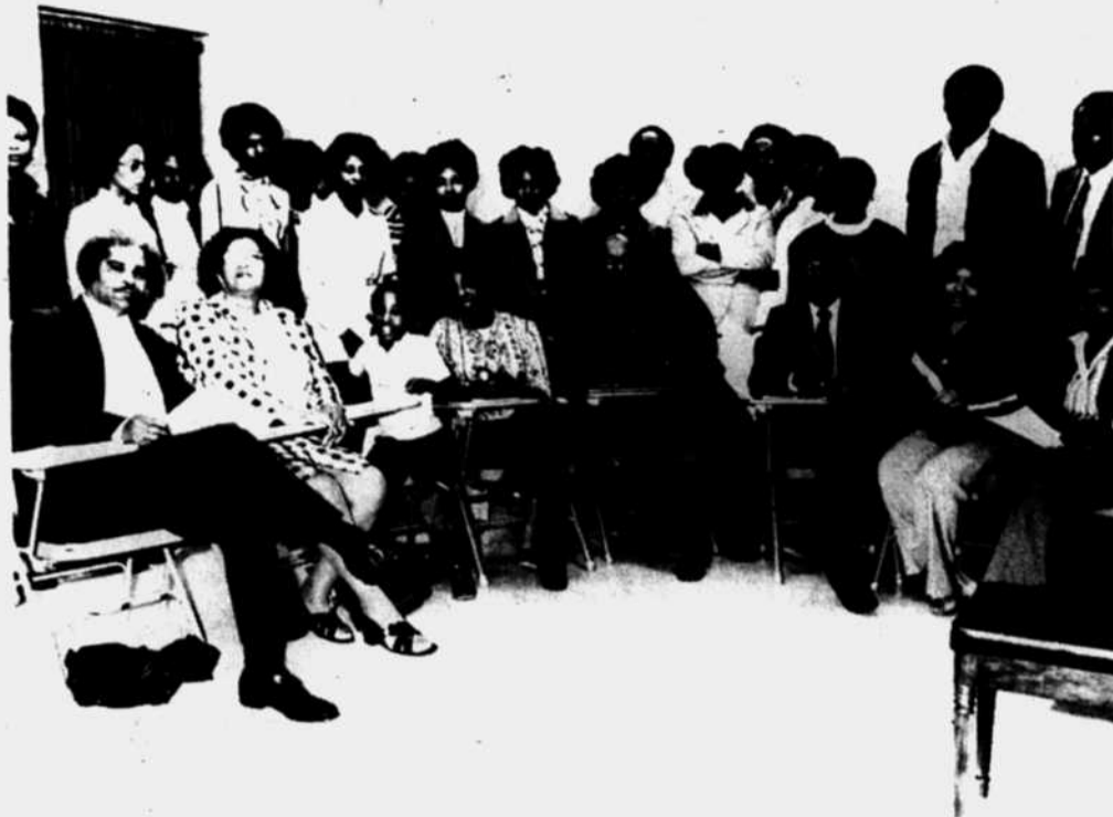
THE SUPPORT COMMITTEE

4. Participants must be willing to accept supervision from the project staff, and determined to be suitable for group living.