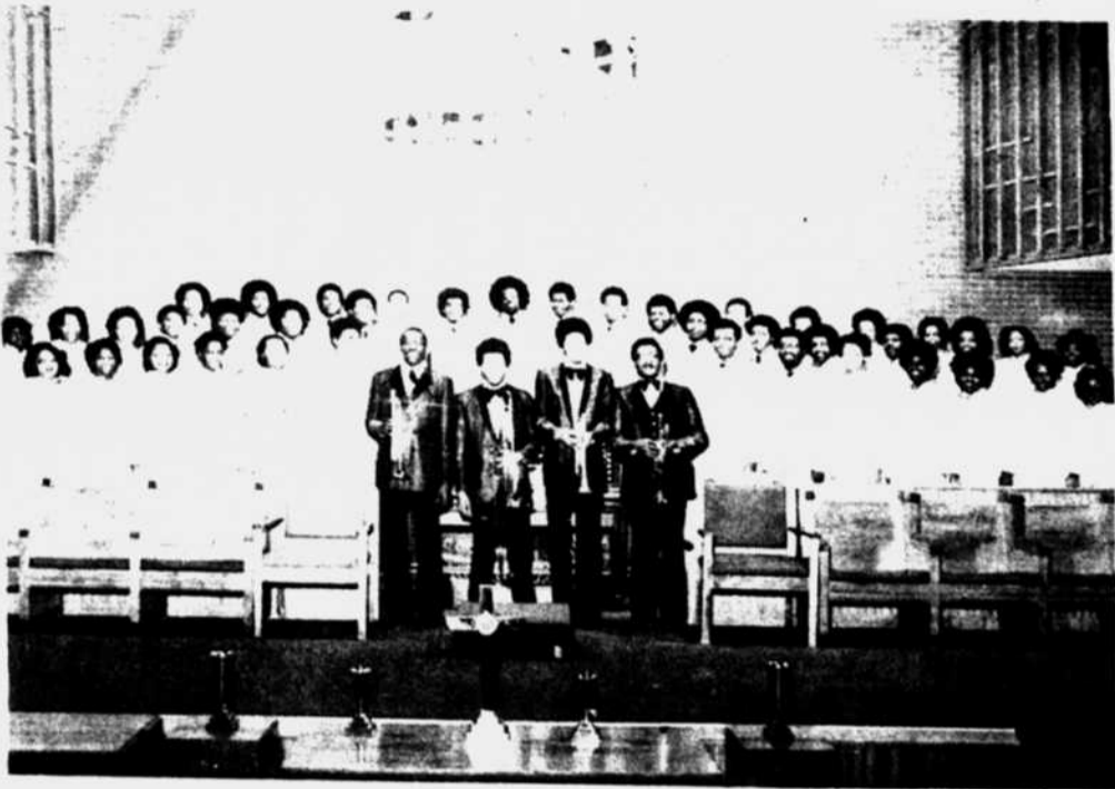
FAMED BISHOP COLLEGE CHOIR —From Dallas, Texas

The summer food program provides free, nutritious meals to children in needy areas during the summer months (May-Sept.) or during any school vacation of more than three weeks for schools with a continuous school year. Children 18 and under, and handicapped individuals over 18 who participate in a