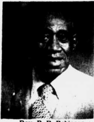
... New Zion pastor

At 6 p.m. the Paradise Voices of New St. John's will present a special program with outstanding choirs from the surrounding area taking