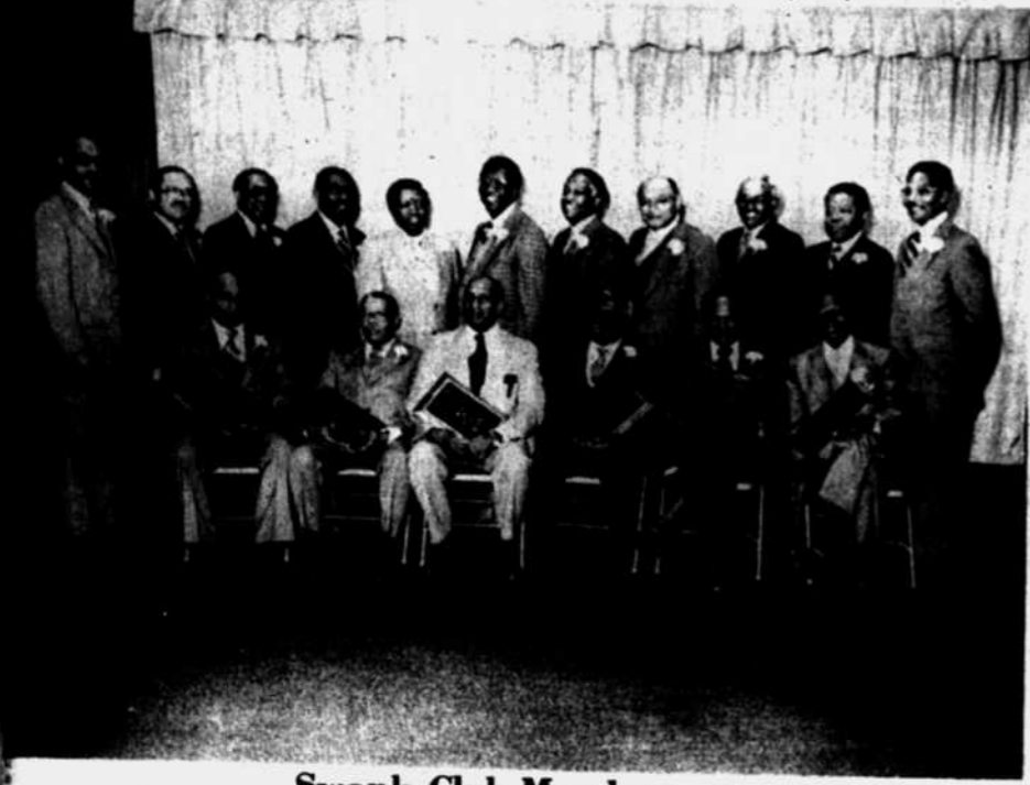
Swank Club Members ...With Their Honorees