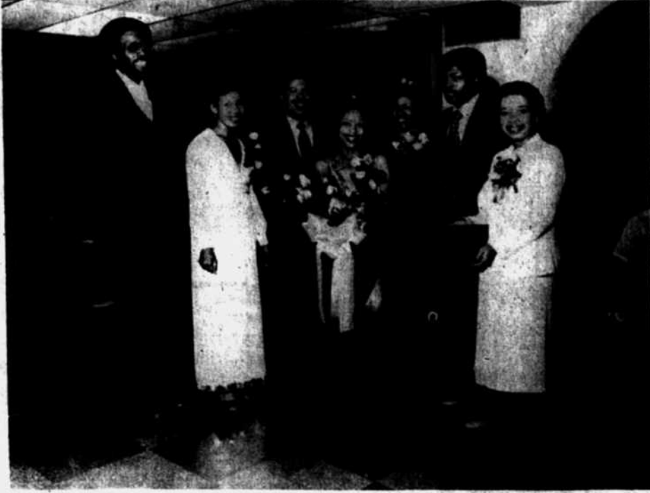
MEMBERS OF J.C. SMITH ALUMNI POSE