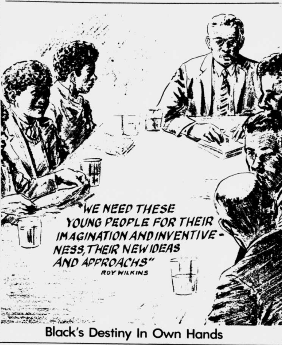
Black's Destiny In Own Hands

believe "we need separate schools for all Catholics...Baptists...Irish...Black Americans...dog lovers...or those who write with their left hand" was purely rhetoric and not based on facts.