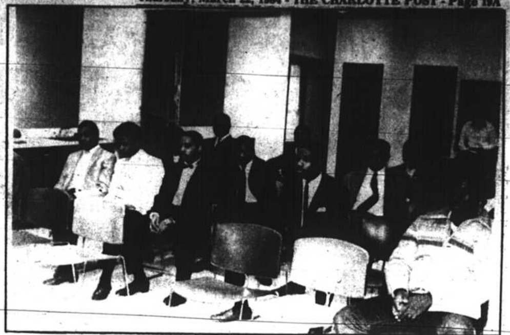
Beaux Await Presentation

The "Family Affair" celebration will begin with a Hot Dog Supper Sale sponsored by the Gaston County Extension Advisory Council. Now, into the down-home county fair spirit, hot dog in hand, stroll through the variety of informative and educational booths that will be featured throughout the building. Step right up and try your luck at computers, then have your pressure canner checked so that all your vegetables will be the blue-ribbon kind. Or, maybe you would enjoy seeing the mystical world of the Gaston County Art and History Museum.