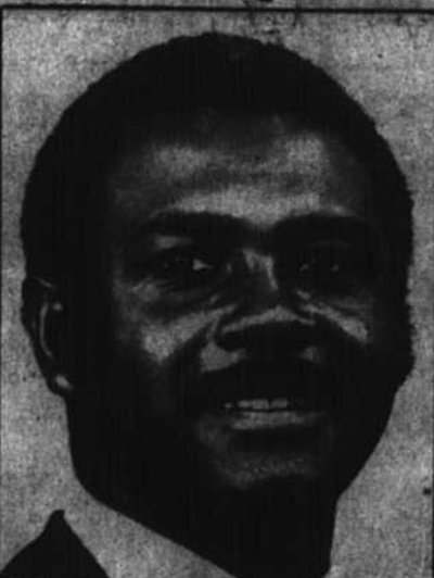
Harvey Gantt .....Charlotte Mayor