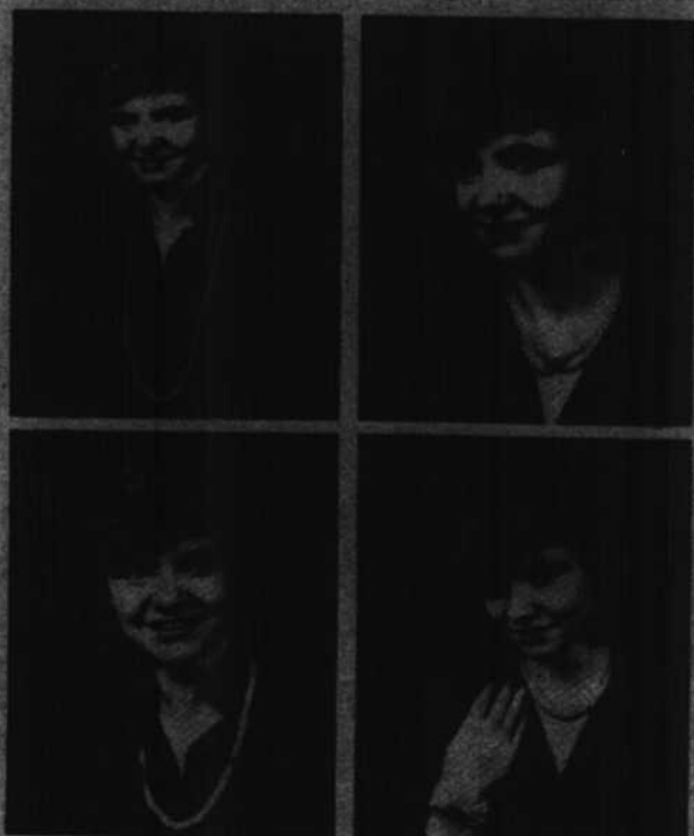
PICTURED ABOVE, innovative "Enhancers" and versatile multi-use jewelry. Top: A 30 inch strand of cultured pearls is converted into a double strand choker with the addition of a 14K gold and cultured pearl and diamond shortener by Walter Edbril, Inc. Bottom: A baroque cultured pearl necklace by August Gem Corporation with 14K gold matte and polished finished clasps is transformed into a choker and bracelet ensemble.

The diamond has been considered to bring victory, and is an emblem of fearlessness and invincibility. Many believe that