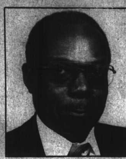
T... To be honored

The church is located at 457 Wellingford St. (597-8249). Women's classes started last month and are held from 7-8 p.m. on Tuesdays. The men's classes are held each Wed-