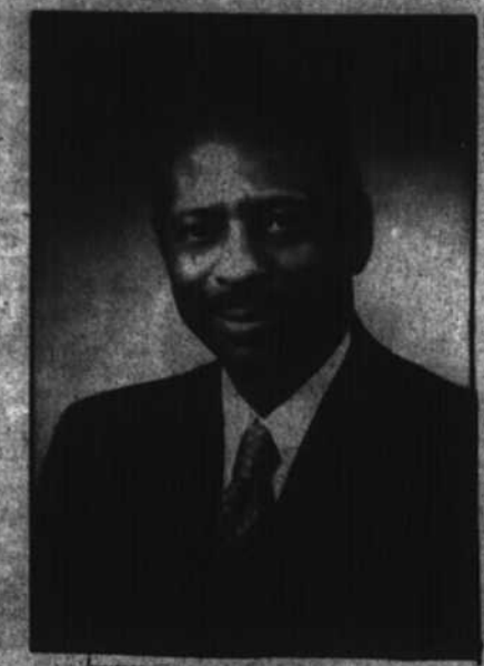
... Public relations chairman

ter, train and involve them in the responsibilities of participating citizenship and to develop in them personal fitness." There are five distinct programs that boys interested in becoming a part of this organization can affiliate. These are the Tiger Cubs, an adult-boy partnership for seven-year-olds; Cub Scouts, for boys through the ages eight and 10; Boy Scouts, for boys from age 11-18; Varsity Scouts, a simpler uniform combines with a sports emphasis for boys ages 14-18; and Exploring, a coed unit that teaches 15-21 year olds about career and hobby interests. Regardless of income, disabilities, race or any other factors, all eligible young people are encouraged to become a part of the Scouting program. Check with your local elementary school and find out if the Fall Roundup program will be held there. For more information, contact 333-5471.