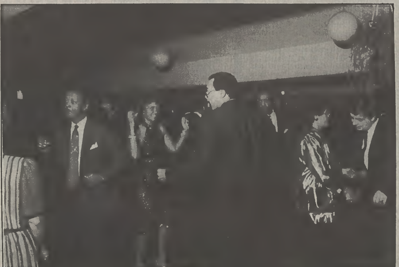
They boogled right into the New Year at the Friends Of The Arts New Year party.