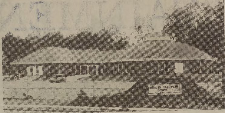
Northeast Seventh-Day Adventist Church opens this week.

•Plaza United Methodist Plaza United Methodist will start a casual, early morning service on Sundays at 8:45 a.m. starting on June