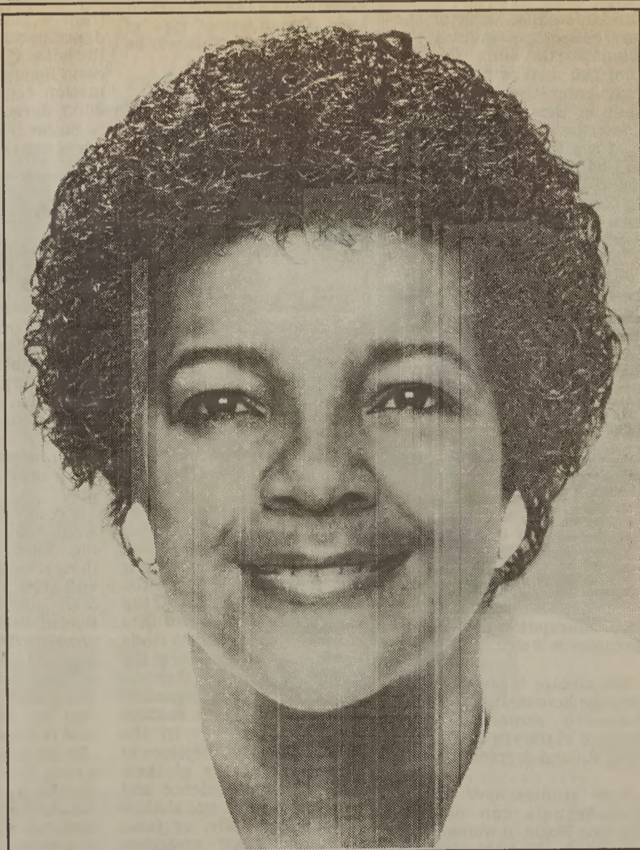
EVANGELIST SHIRLEY CAESAR