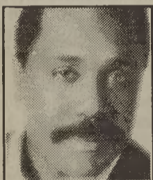
Demond Wilson Formerly of Sanford & Son

featuring * Nightly Services 7:30PM - all seats are FREE *