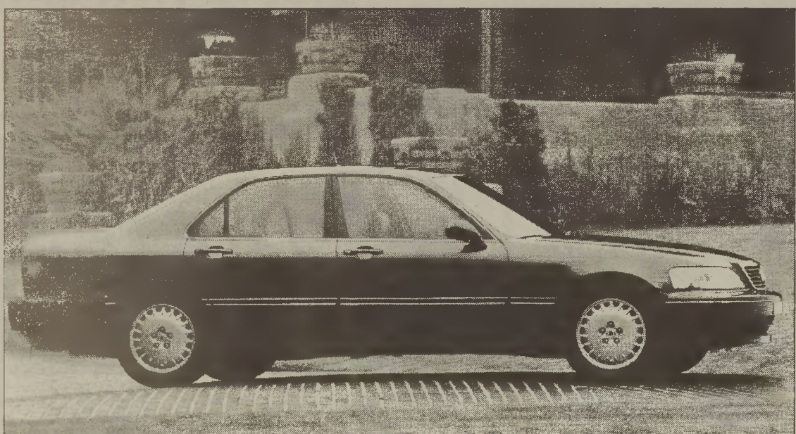
'96 Acura 3.5RL