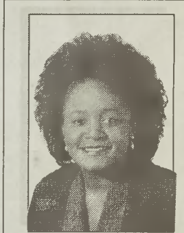
Attorney at Law