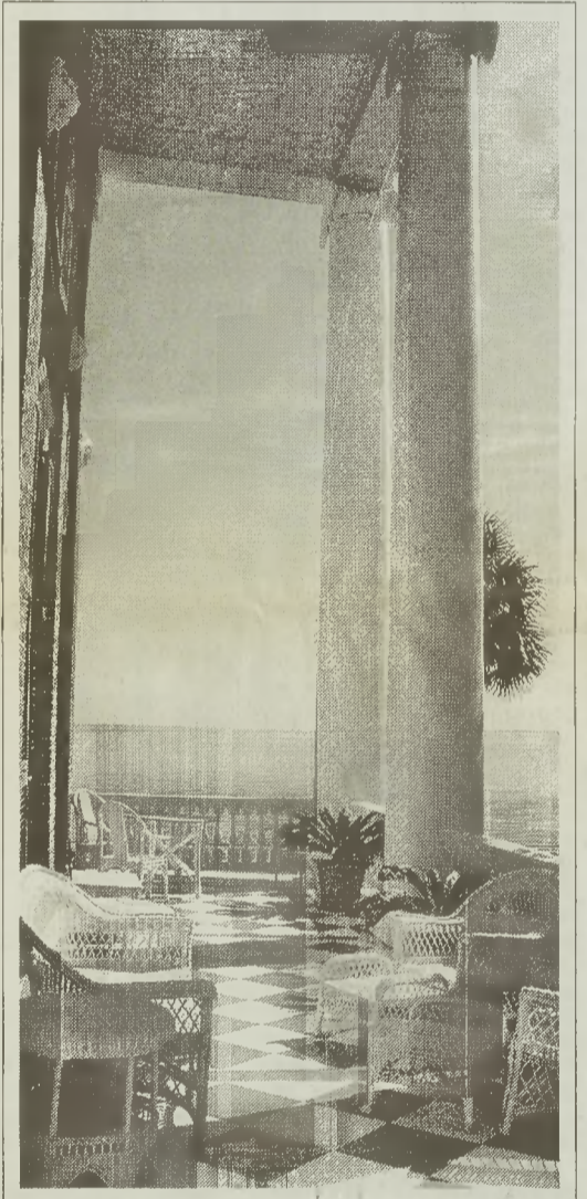
The Roper Hour Picnic Overlooking Charleston Harbor