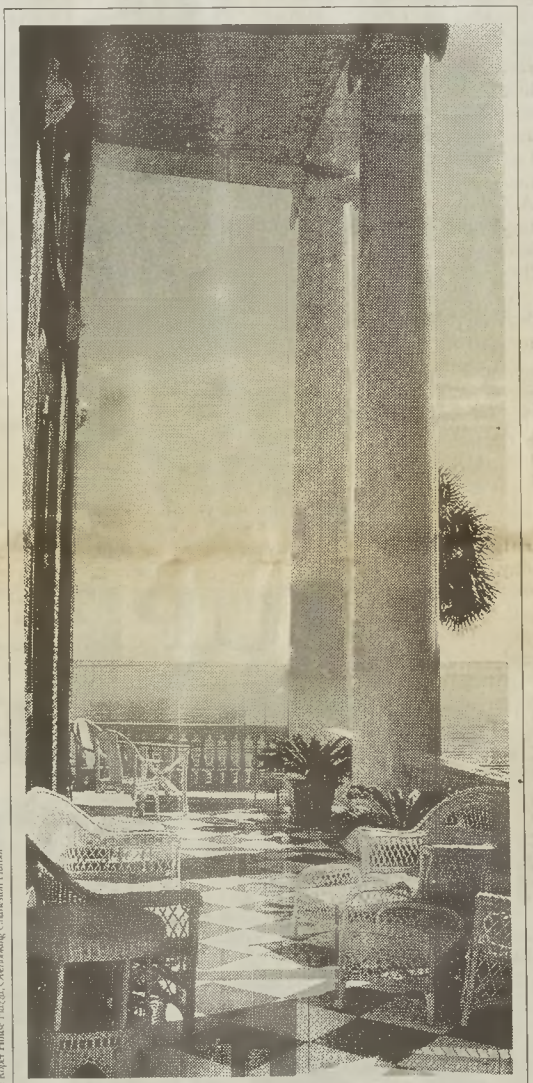
The Roger House Tours, Overlooking Charleston Harbor

In Charleston, we have a slightly elevated view of the perfect summer vacation.