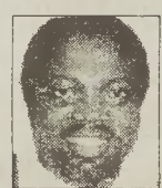
JACKSON: Let's play two.

One of the proposals on the table Saturday at the NCAA Convention in Nashville, Tennessee is the creation of a black college Div. II post-season football bowl game.