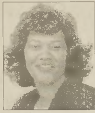
BIBBS: Feels she has support of administration at Hampton.

▼ SUCCESSFUL GRAMBLING WOMEN'S HOOPS COACH TAKES HAMPTON POST