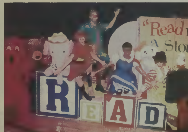
Storybook characters stop in Charlotte last week on a national "Read Me a Story" tour sponsored in part by Visa. Characters included Clifford the Big Red Dog, Angelina Ballerina, Babar, Jesse Bear, Little Red Riding Hood, Lyle the Crocodile, Mother Goose, Peter Pan, Pippi Longstocking and Curious George. They appeared at Myers Park High School, the Public Library Main Branch and Eastland Mall. The tour is designed to encourage children to read and introduced a Reading Check-up Guide. Sponsors hope to raise $1 million for the Reading is Fundamental campaign, which gives books to kids. Visa will donate to RIF each time a Visa card is used before Dec. 31.