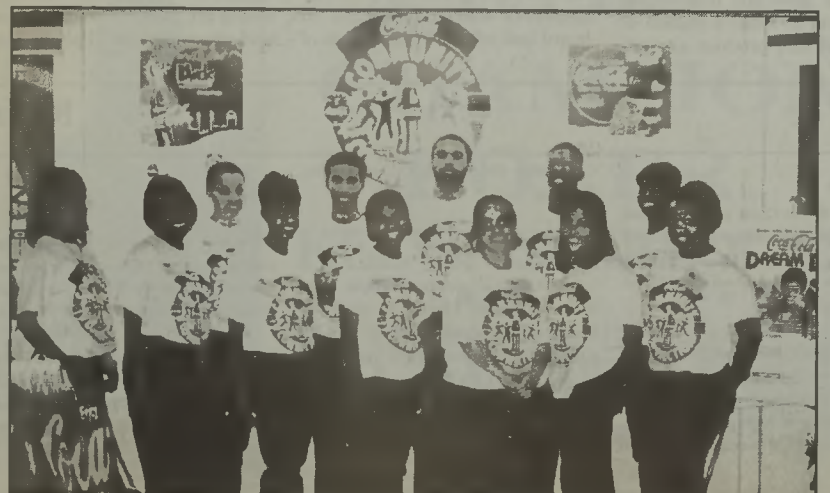
Community Connection: Coca-Cola Bottling Co. Consolidated was a major sponsor of the African-American Consumer Expo. Providing area students the opportunity to participate in the two day event and earn extra income for the holiday season.

If you are interested in the Coca-Cola Community Music Van appearing at your non profit event call: 393-4365. Fax 393-4265