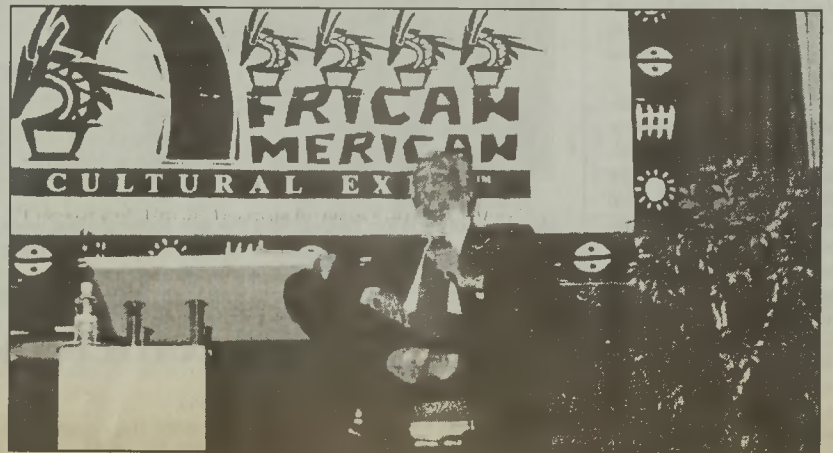
African American Cultural Expo: The nation's premier showcase of Africa-American history, arts and business recently visited the New Charlotte Convention Center. Comedian and activist, Dick Gregory is pictured addressing the crowd at the two day event.