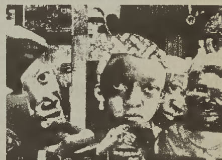
Mysteries, (detail), 1964