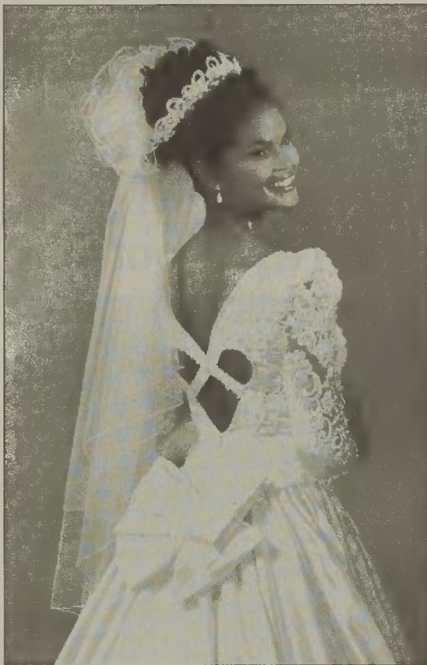
on what illusion you want." As a rule of thumb, gowns bought off the rack should be fitted by a professional seamstress.

"A padded top will balance out full skirts or straight skirts," Chisolm said. "It just depends