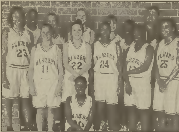
The Concord Blazers won the 14-under N.C. AAU basketball title last week with a 73-64 win over the Triangle Knights.