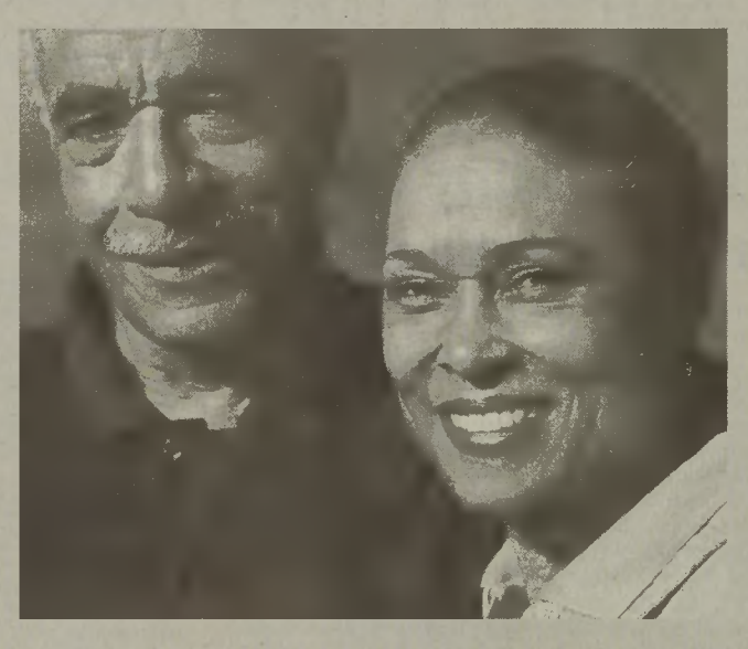
AARP. Creating change in our community.

We couldn't be your voice in Washington without being your neighbor in North Carolina.