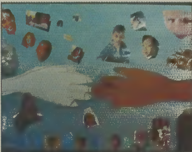
First place, elementary K-2 art contest Briana Coggin • Endhaven Elementary School