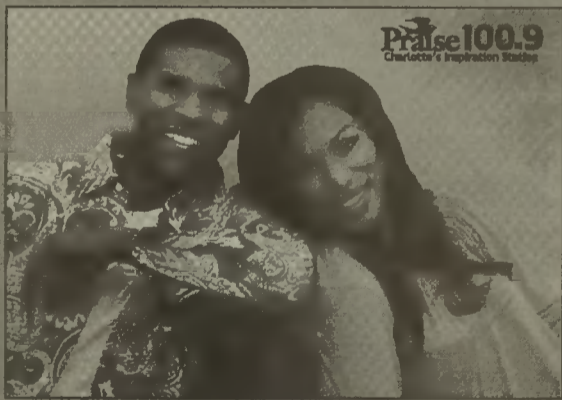
Multi-time Dove Award Winners

TICKETS STARTING AS LOW AS $10 704.424.WNBA • charlottesting.com • ticketmaster.com Special discounts available for groups of 10 or more