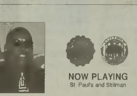
NOW PLAYING St. Paul's and Stillman