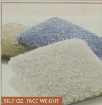
50.7 OZ. FACE WEIGHT