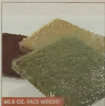
60.8 OZ. FACE WEIGHT

America's #1 source for style, selection and installation. See store for details.