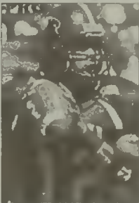
NCCU Sports Photo