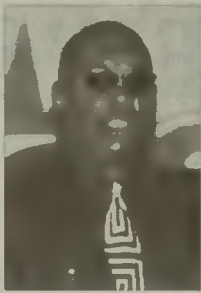
BCSP Photo SPEARS: His Grambling Tigers at 9-1 now top the BCSP Top Ten with two more hurdles to clear.