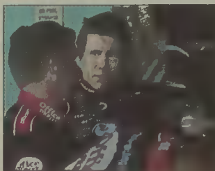
Carl Edwards (right) chats with his crew at Homestead. Edwards finished third in the Chase.