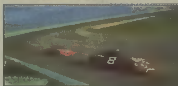
Dale Earnhardt Jr. (8) started 40th, but worked his way to a 19th-place finish in the season-ending Ford 400.