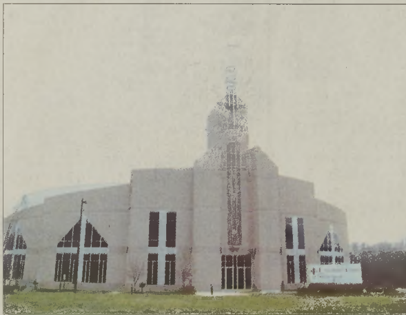
University Park Baptist Church will host a hepatitis education and awareness screening Saturday and Sunday on the Beaties Ford Road campus. Screenings will also be held at the Park South in Pineville.